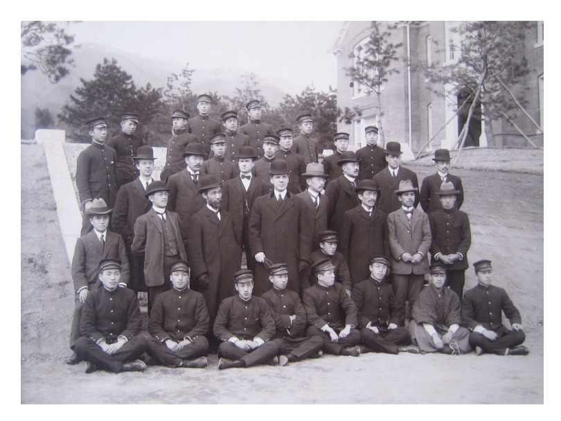
Commercial Club, 1912