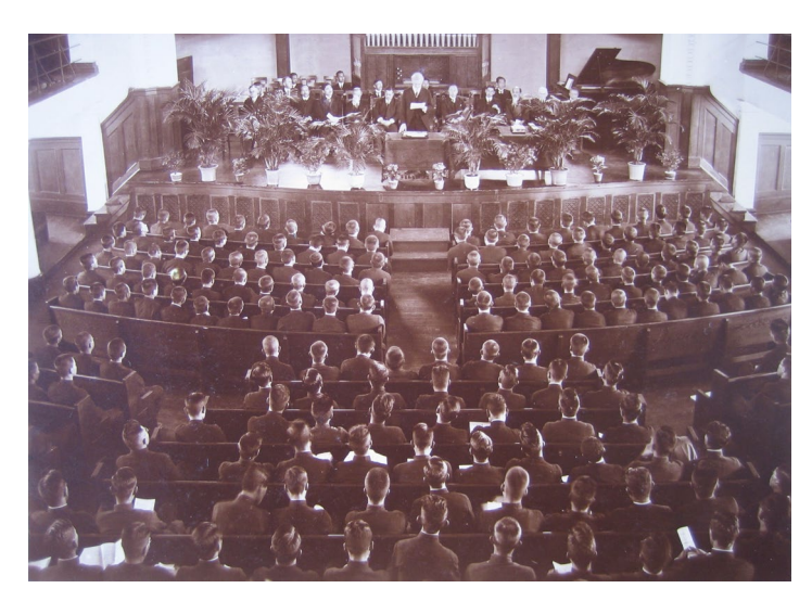
Graduation ceremony, March 8, 1926