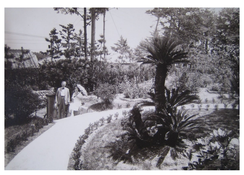
Madame et Monsieur Bates approchent la maison par la nouvelle porte.