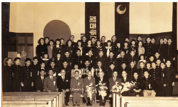
All-Japan English Oratorical Contest for the Mainichi Trophy, 1952

Two years later, this contest expanded into the “All-Japan English Oratorical Contest for the Mainichi Trophy,” which included senior high school